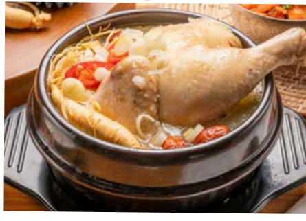
人参鸡汤 / Ginseng Chicken Soup