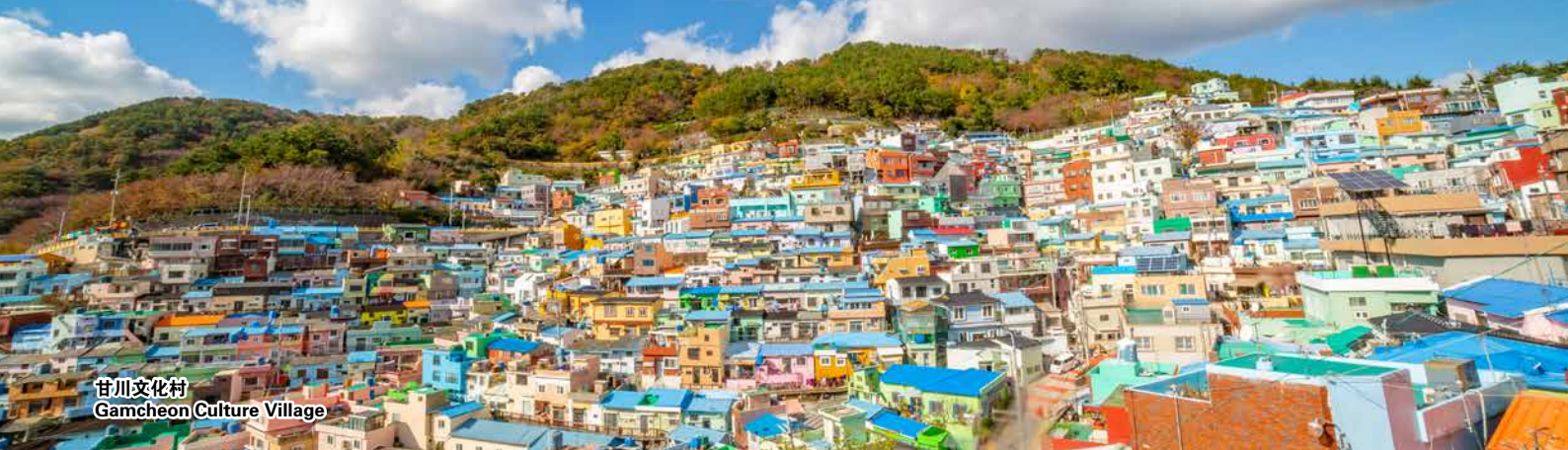
甘川文化村 Gamcheon Culture Village