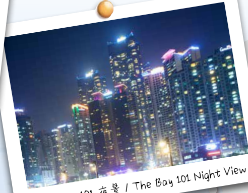
The Bay 101 夜景 / The Bay 101 Night View