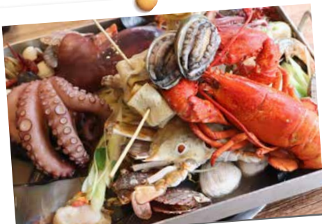
龙虾一只鸡 / Lobster Seafood Steamboat