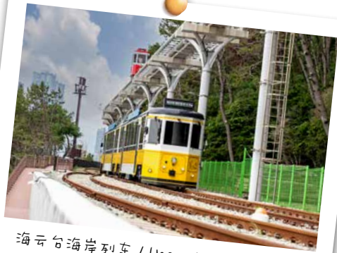
海云台海岸列车 / Haeundae Beach Train

※ Sequence of the itinerary is subject to change according to the final flight confirmation.