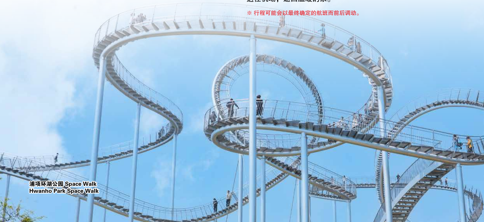
浦项环湖公园 Space Walk Hwanho Park Space Walk