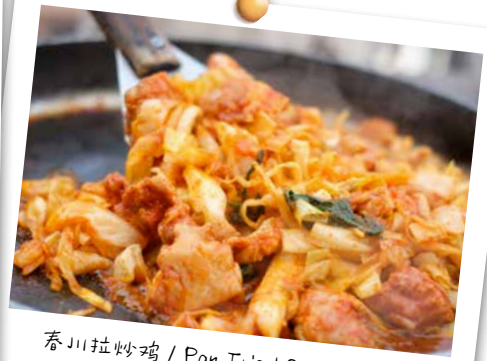
春川拉炒鸡 / Pan Fried Spicy Chicken